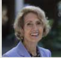
The Honorable Connie Morella

Represented Maryland's 8 th congressional district in the U.S. House of Representatives from 1987-2003