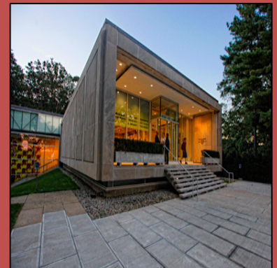
BU Behavioral Health And Science Center