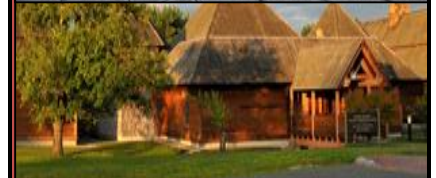
Rose Art Museum