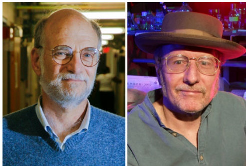
Professor Jeffrey Hall

Nobel Prize Winners in Physiology or Medicine – 2017